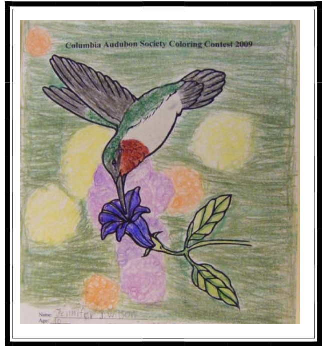
Lena Leuci of Columbia Age 11-15 Category