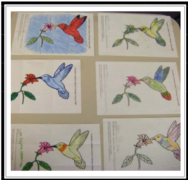
Samples of other coloring contest entrants.